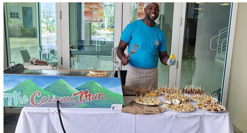
Cassava Man a local entrepreneur has added a variety of fillings to cassava bread in Dominica.

However, to ensure the manufacture of quality products, small scale processors will require access to capital and the requisite training in areas such as Hazard Analysis and Critical Control Point (HACCP) practices, Good Manufacturing Processes, Food Safety and Handling, and Financial Management.