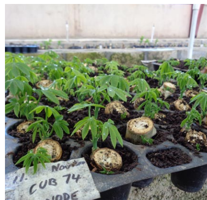
2-node cuttings in nursery.

Dominica does not have tissue culture laboratories but has excellent nursery facilities for weaning and hardening of plants produced from tissue culture materials. The tissue culture facilities at Orange Hill Station in St. Vincent and the Grenadines store a selected germplasm collection ( in vitro ) and accept orders for young plants.