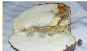
Vascular streaking reduces the quality of cassava tubers.

shelf-life. Physiological deterioration is the main cause of losses after harvesting cassava. This usually manifests as a bluish/blackish discolouration in the roots known as vascular streaking. It is caused by loss of moisture and the entry of oxygen through wounds on the tubers. Vascular streaking results in the roots becoming unpalatable and unmarketable.