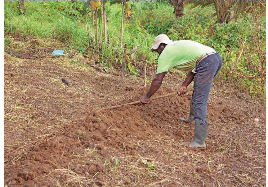
Ridges and furrows facilitate easier harvesting of cassava tubers.