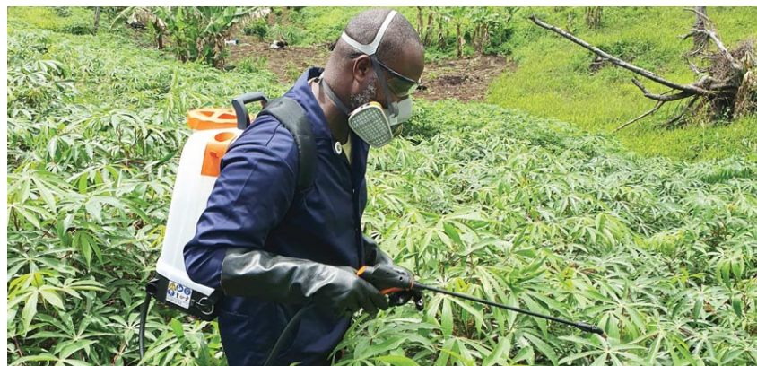
Place a shield over the nozzle of the spray-can to prevent chemical from drifting onto the crop.