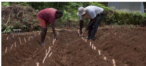
Plant stakes at a 45° angle along the contour.

Always use approved chemicals and prepare them according to the manufacturers' instructions. When handling chemicals always use personal protective equipment (PPE).