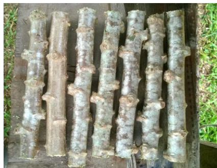
Cuttings should have well developed eyes (nodes).