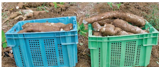
Transporting cassava in harvesting crates minimizes compression damage.

When packing, it is good practice to sort the tubers. Tubers that are damaged, rotting or showing signs of pest and disease attack should be placed in separate crates from the undamaged ones. The damaged tubers can contaminate the wholesome tubers.