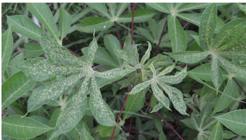
Thrips damage.