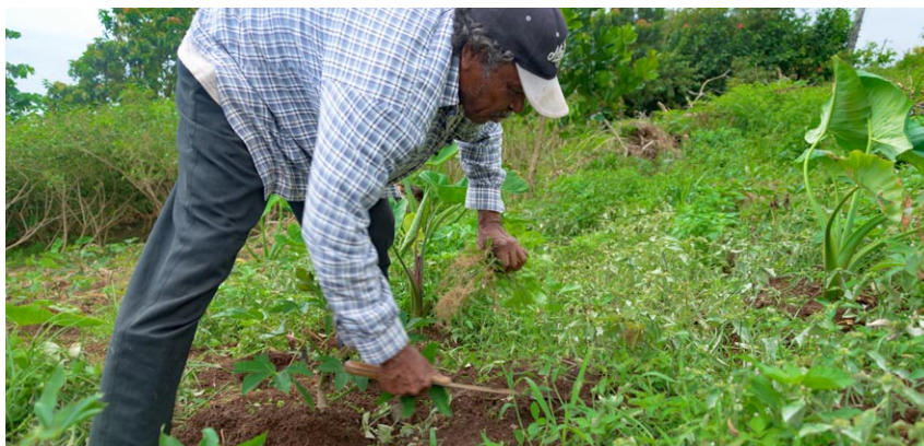
Some weeds are best controlled by uprooting and destroying.