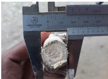
The diameter of the cuttings should be at least 2cm thick.