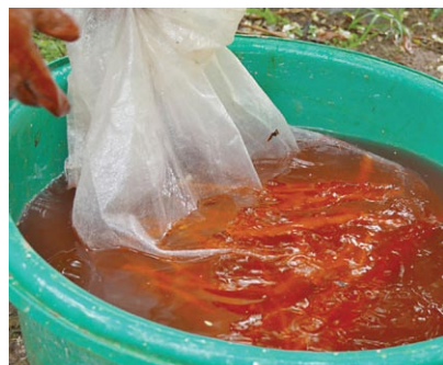
Before planting cuttings should be treated in an insecticide/miticide solution.