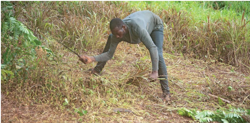
Manual land clearing.

The MoBGEANFS as well as private service providers can be contacted to do mechanical land preparation. Farmers will need to budget for this, when using private service providers as it is a paid service. Ideally, you should schedule this service 2 to 3 months in advance to avoid undue delays.