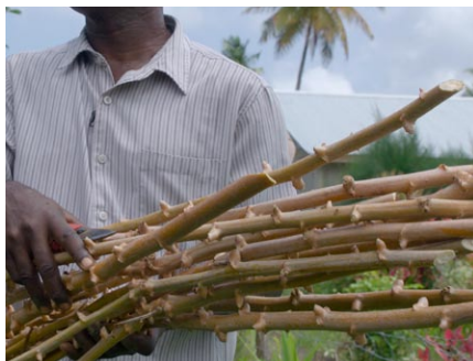
Choose stakes from healthy parent plants.