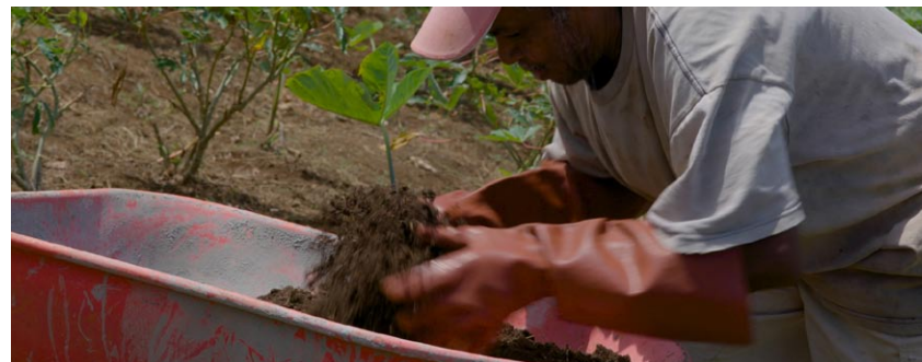
Organic matter must be well cured before use.