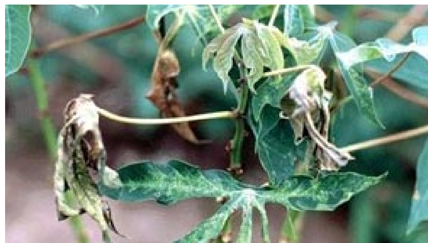
Leaf wilt caused by Cassava Bacterial Blight.