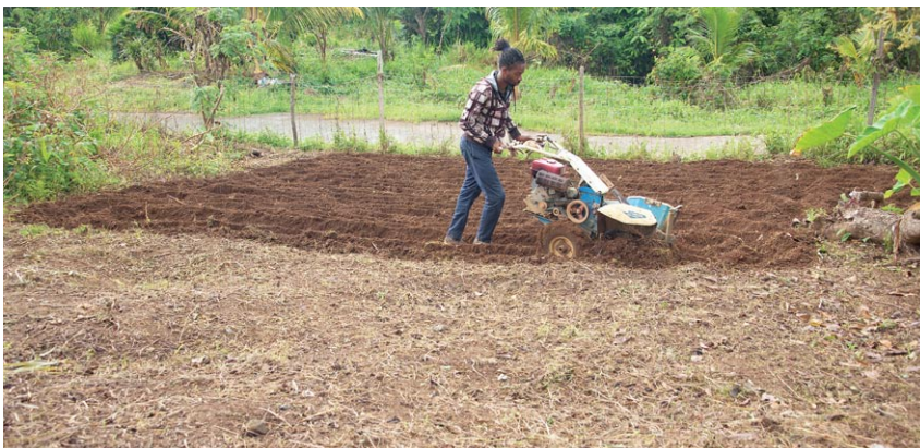
Ploughing breaks up the soil clods.