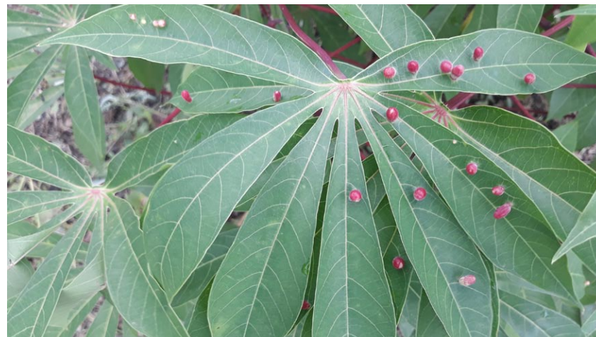
Gall Midges.