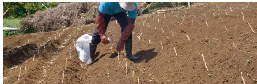
First fertilizer application takes place at planting or within 5 days of planting.