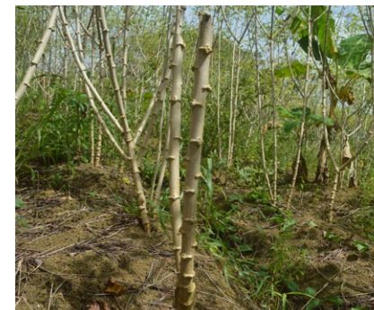
Cutting back trees for easy harvesting.