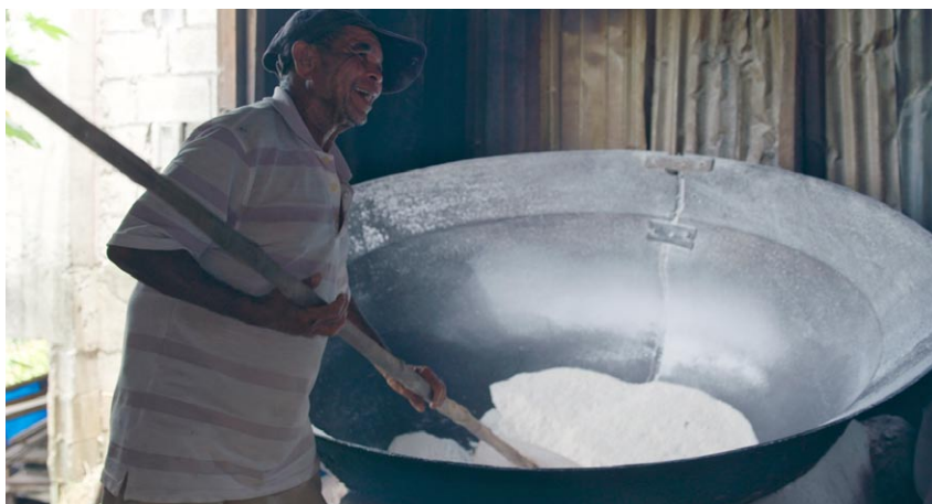
Farine production. To propel the industry, local agroprocessors must be trained in food safety.

Industrially, starch and bioethanol can be derived from the cassava plant and with Dominica's thrust to become the first climate resilient country, these can present significant opportunities.