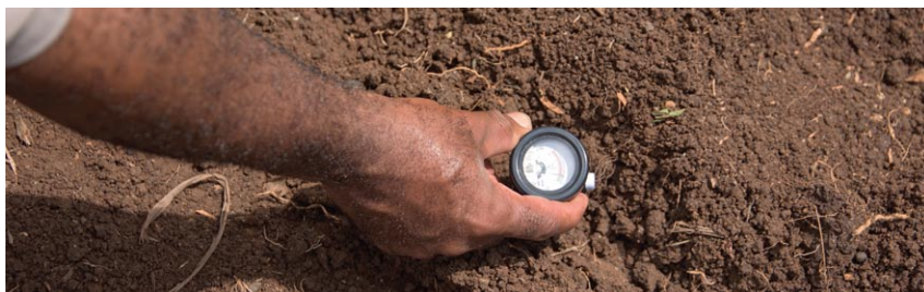
A soil test is recommended before land preparation.

Soil pH is the measure of acidity or alkalinity of the soil. The pH scale goes from 0 to 14 with pH 7 as the neutral point. Soil pH is an important consideration, as it influences the availability of nutrients.