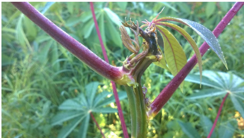
Shoot fly damage.