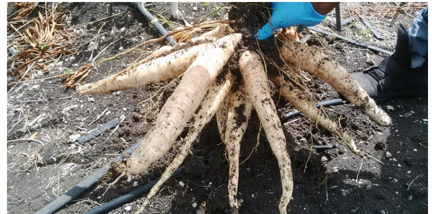
Cassava tubers.