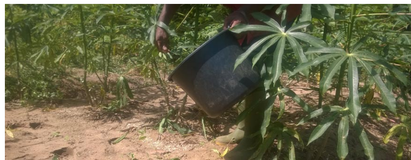
Second fertilizer treatment takes place, 90 days after planting.