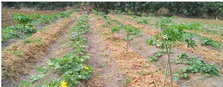
Intercropping of cassava, St Lucia.

Research is needed to identify the suitable crops that can be profitably intercropped with cassava in Dominica.