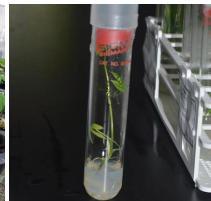
Tissue culture cassava plantlets.